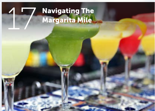
17 Navigating The Margarita Mile