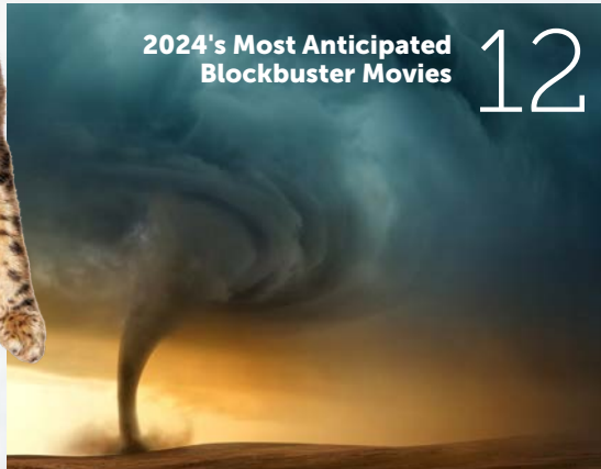
2024's Most Anticipated Blockbuster Movies 12