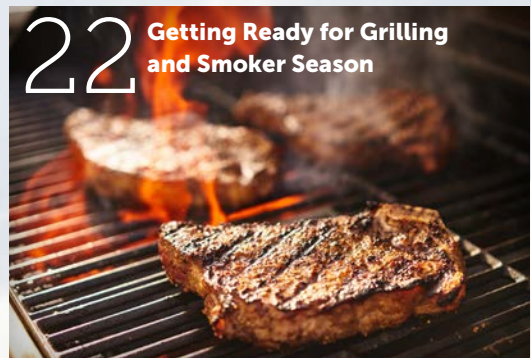
22 Getting Ready for Grilling and Smoker Season