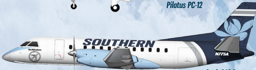
Saab 340 B