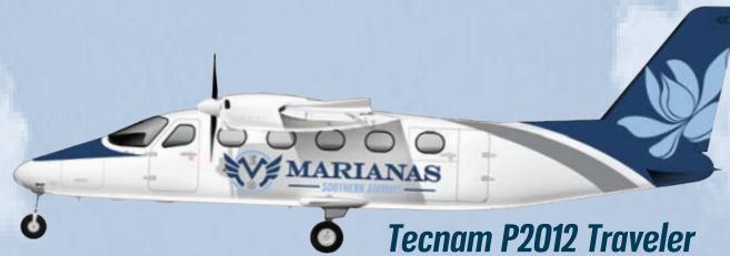
Tecnam P2012 Traveler