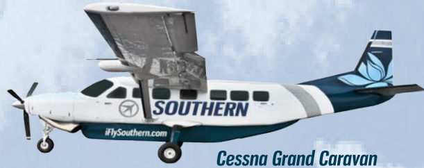
Cessna Grand Caravan