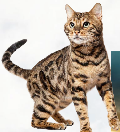
Feline Fun in the Sun: Exploring The Lanai Cat Sanctuary 6