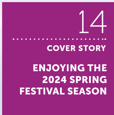
14 ..... COVER STORY ENJOYING THE 2024 SPRING FESTIVAL SEASON