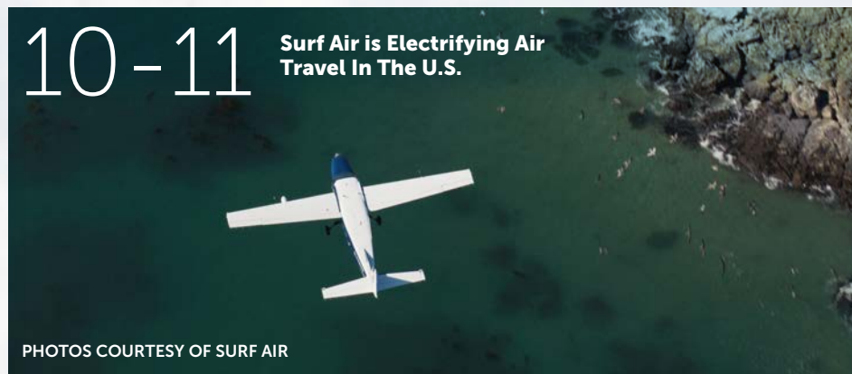
10-11 Surf Air is Electrifying Air Travel In The U.S.